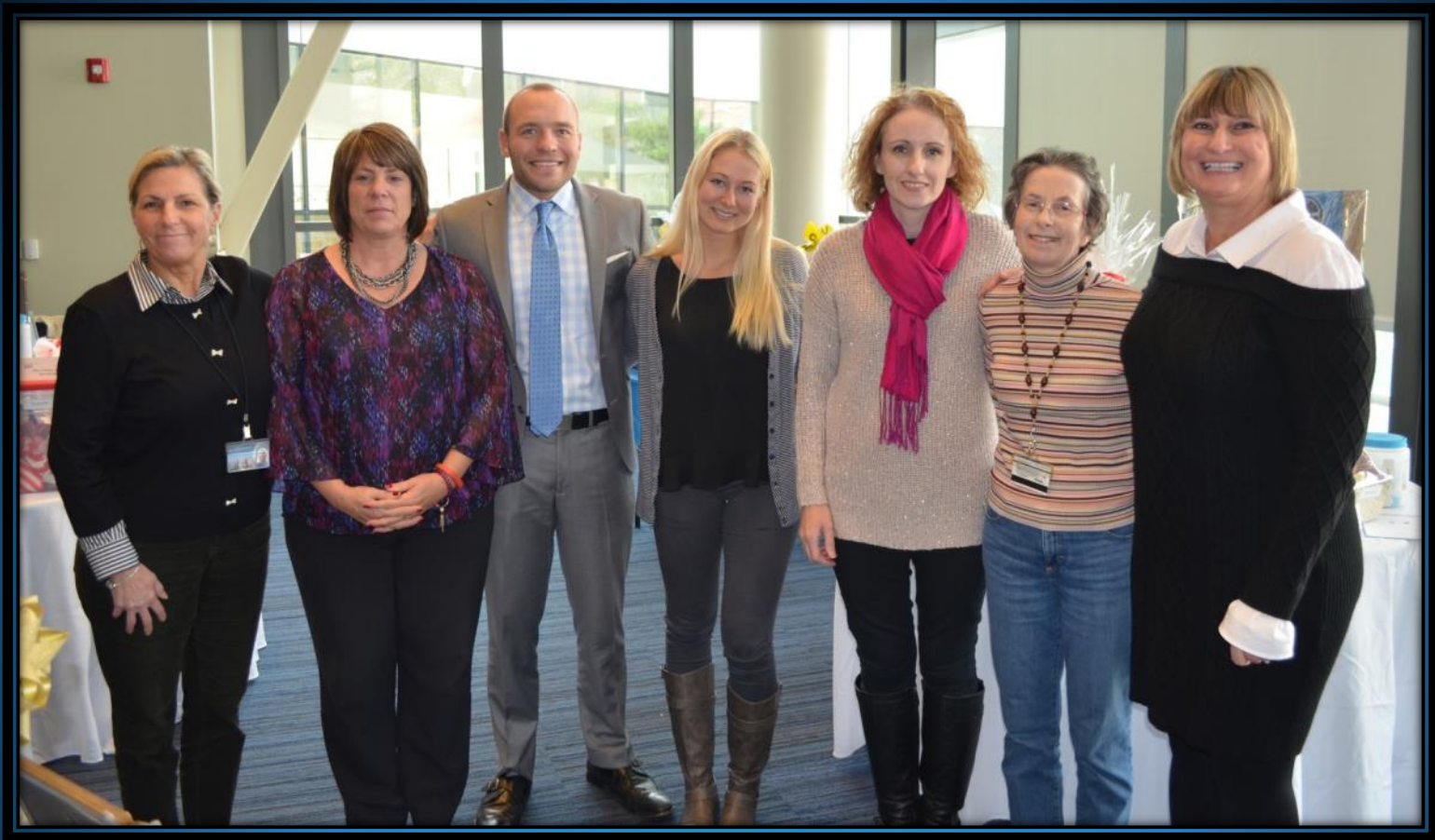
Community Service Committee Members with representatives from The Littlest Heroes