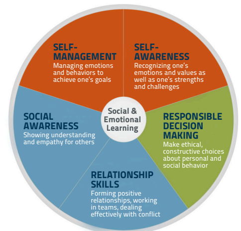
FIG 3. SOCIAL & EMOTIONAL LEARNING FIVE CORE COMPETENCIES

Becoming an Ally: Responding to Name Calling and Bullying which helps students go from bystander to one who takes active steps towards promoting a positive school environment.