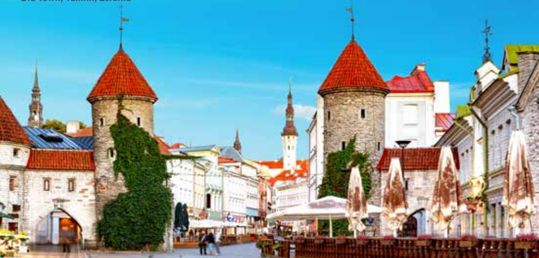
Old Town, Tallinn, Estonia

In his oft-quoted poem, "The Road Not Taken," Robert Frost awakened the idea and determination in many to choose the road less traveled; to overcome fear and avoid regrets. It sparked the quest for adventure in those wishing to experience more from life. Intrepid world travelers manifest this idea by seeking out destinations less traveled, such as Scandinavia and the Baltic Sea, which is surrounded by nine countries in Northern Europe. Here, travelers have the rare opportunity to visit a number of countries and experience a kaleidoscope of cultures in a short period of time when cruising by ship from port to port. Ancient architecture, centuries-old history, storied landmarks, fascinating cities, and breathtaking, romantic scenery provide the perfect backdrop and opportunity to take the road less traveled, which will surely make all the difference.