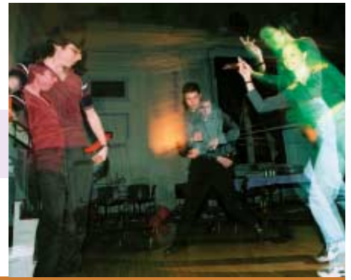
RAINBOW BOB: STUDENTS DANCE IT UP AT THIS YEAR'S LAVENDER BALL. IN THE PHOTO AT LEFT, MEMBERS OF THE PHI KAPPA THETA FRATERNITY SPIN THE TUNES.

comprehensive, ongoing effort to introduce members of the campus community to people from different cultures and lifestyles. "Part of what an education is all about is to learn about other people, to learn to be accepting and realize that people are different," says Jane Daroff. "This campus doesn't do enough to make that happen."