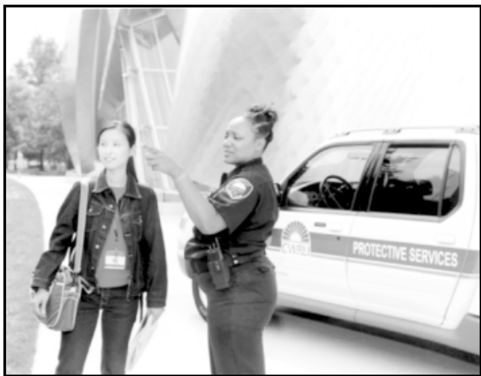
An always-helpful security officer gives a student directions outside the new Peter B. Lewis Building on campus.

All of the residence halls are secured by a campus-wide