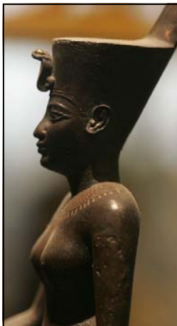
Egyptian Neith, Hymn of Neith , predynastic period; her hymn is inscribed at the Esna Temple, restored in the Ptolemaic/Roman period.