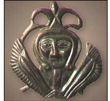
Canaanite Anath, goddess of Love and War, Ugarit Epic , thirteenth century BCE.