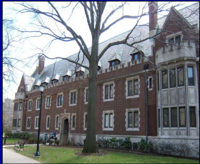
Mather House, Home of the Judaic Studies Program