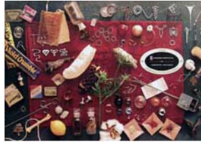
Tales of Contraception quantity _____