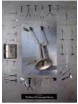
Stem Pessaries quantity _____