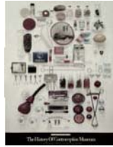
Contraceptives quantity _____

Book: Tales of Contraception: A Museum of Discovery, by Percy Skuy (1995) 48 pages, 9 1/4 x 11 1/4 inches Hardcover $30.00 quantity _____ Softcover $25.00 quantity _____