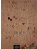
IUD's quantity _____