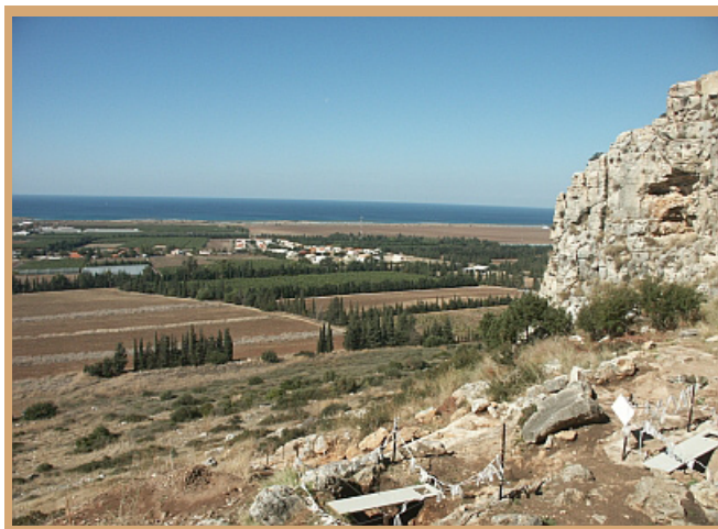
Mt. Carmel caves in Israel. More pictures can be found at: www.tau.ac.il/~anatom2/misliya.html