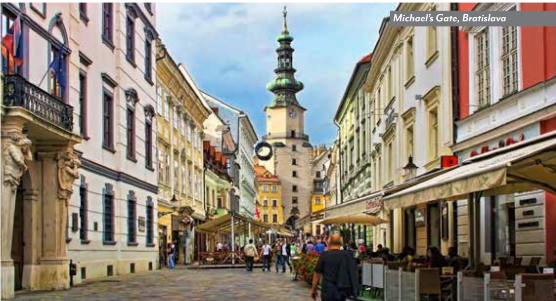
Michael's Gate, Bratislava