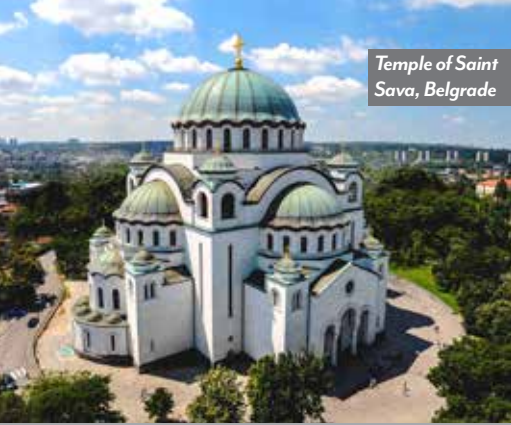
Temple of Saint Sava, Belgrade