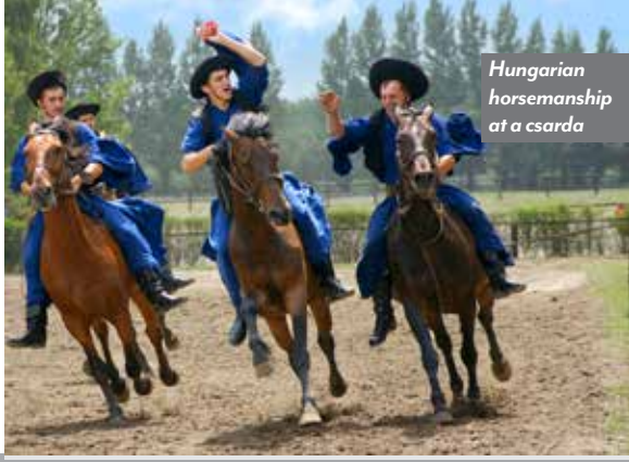
Hungarian horsemanship at a csarda

Continue to Veliko Târnovo's historical town center and see the 12 th -century Tsarevets Fortress.