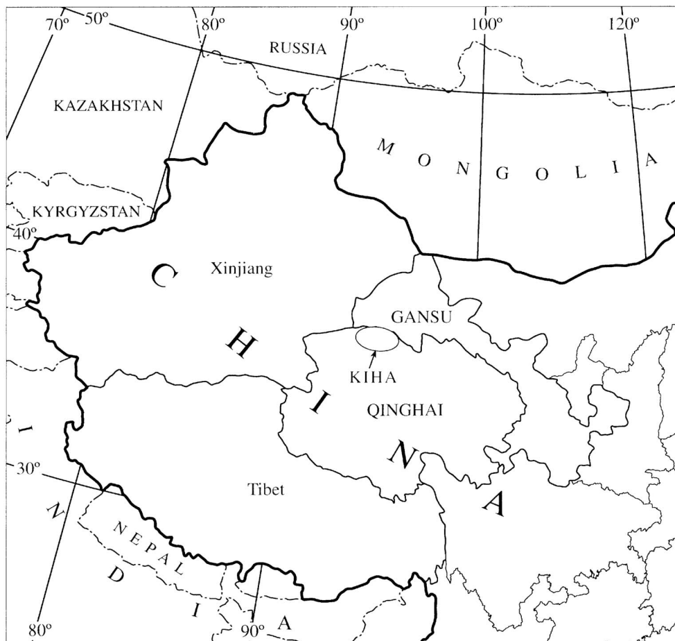
Fig. 1 Location of the Kharteng International Hunting Area (KIHA), Aksai County, Gansu Province, China. Although administered by Gansu, KIHA is located within Qinghai Province as displayed on most maps.

We conducted a preliminary survey of argali distribution and initial interviews with Aksai staff during August 1997. While attempting to capture argali for radio-marking, we conducted additional informal surveys and