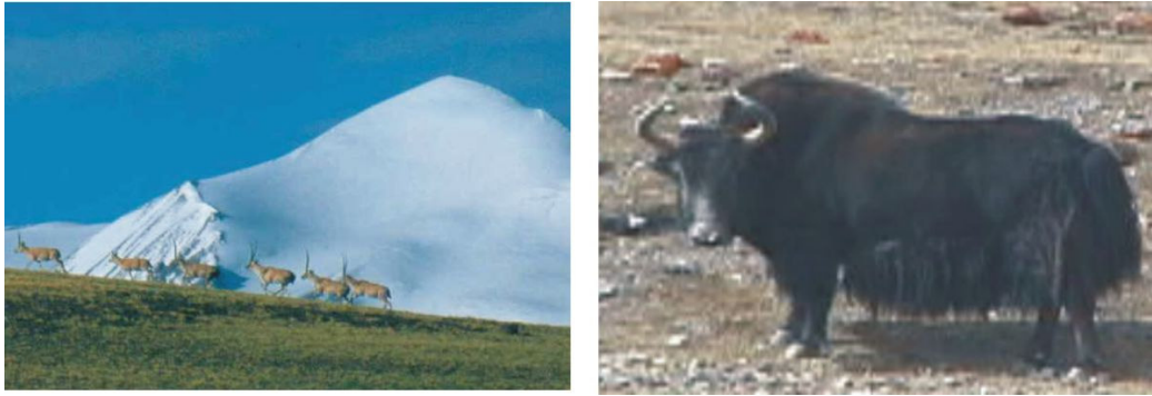
Fig. 2. Chiru (Tibetan antelope) and wild yak in the Aru basin.

Some 30 000 nomadic pastoralists depend on rangelands within the reserve for livestock grazing, and those in areas with significant wildlife density have traditionally depended in part on hunting for supplementary subsistence and trade (in part for shahtoosh). With rapid changes in wildlife markets, government subsidised modernisation of pastoralism, and concerns over preserving Tibet's wildlife populations, the establishment of the nature preserve has brought into sharp focus conflicting aspects of these various factors. The TAR's 1997 request for assistance focussed on development aid associated with the creation of the reserve; our project aims to provide baseline information upon which management of wildlife and livestock can be developed to ensure the continued presence of threatened wildlife as well as a better standard of living for nomads in the reserve.