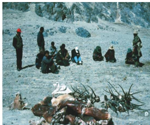
Fig. 5. Confiscation of antelope traps from a nomad (left) and chiru pelts and horns confiscated from traders (right) who bought them from nomads, both just SE of the Aru basin.