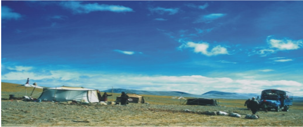
Fig. 3. Nomad camp in the Aru basin, with a recently purchased truck used for moving camp and transporting wool to market.