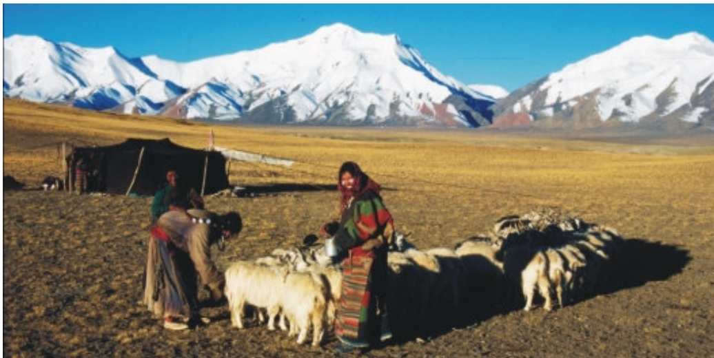
Fig. 4. Nomad women milking goats at 5000 m elevation in the Aru basin. Chiru and gazelle are common and kiang occasional on the plains in the foreground, whereas wild yak, blue sheep, snow leopard and brown bear are found in the lower parts of the mountains.

The nomads throughout the area are currently undergoing a modernising of livelihoods affected by the introduction of permanent winter houses (altering seasonal migration patterns), development of local community administrative centers, vehicular transportation, changing international trade in shahtoosh and cashmere and a move towards stricter wildlife conservation laws (Næss et al. , 2004). As Schaller & Gu (1994) have noted, "in 1991, 5 families (~40 people) moved their 600 sheep and goats and 45 yaks into the [Aru] basin permanently, primarily to hunt wildlife". This was in addition to about 21 families with about 8600 livestock that used the basin on a seasonal basis at that time (Schaller & Gu, 1994). In 2000, there were about 19 permanently resident families within the Aru basin, and another 30 families that used it part