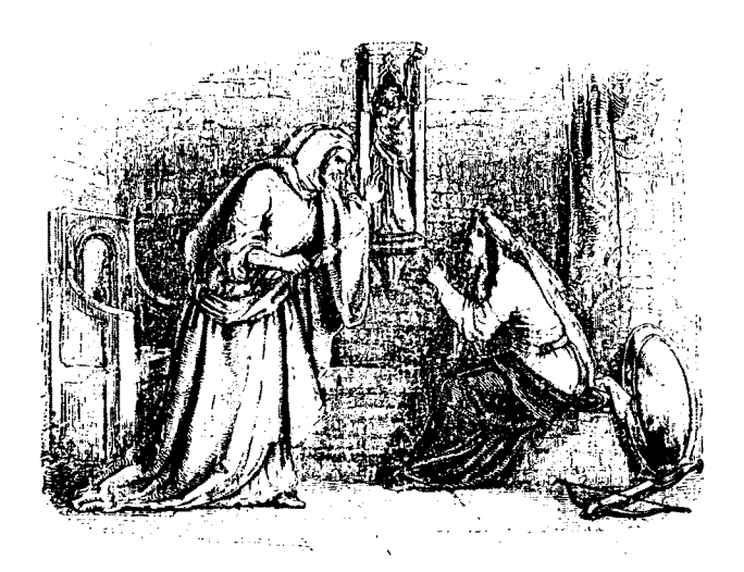
REBECCA BEGS DAME UNFRIED TO AID BER ESCAPE, -Chap. zzin