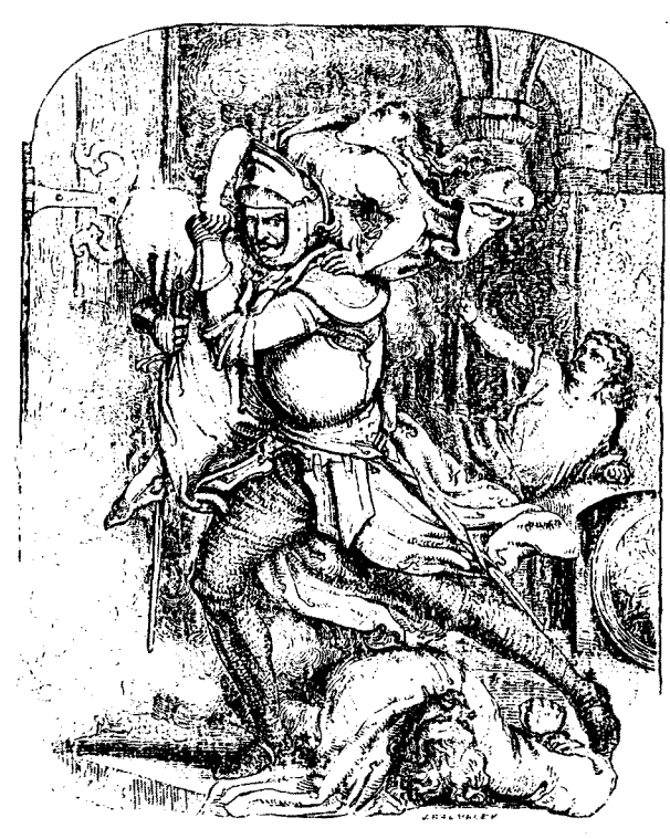
BRIAN DE BOIR-GUILDERT BEARR REBECCA FROM THE BURNING CARTLE OF TORQUE STORE, ... (Tage, xxx).

Department of English Denison University