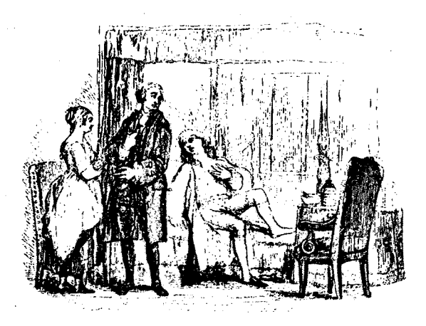
м имон му дек-шеры му конц, ни: ".-. Chap. xxxic.