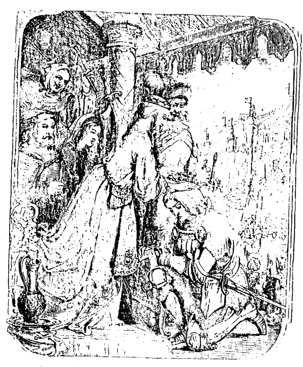
hady rowens believe the cusplet on "the disimmerited," spreathe the tournament, whap the